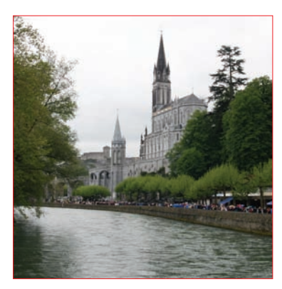
View along the river